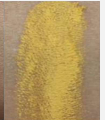
Sumicos Yellow LHM