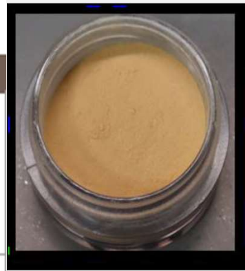
Pearlizing Loose Powder