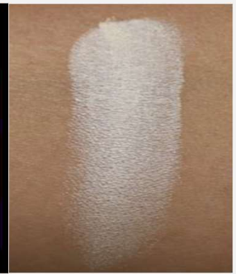
Powder application on hand