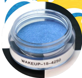
18-4250 Indigo Bunting

If you were born in 2022, 2010, 1986, 1974, 1962 and every 12 years previous, you are a Tiger. 2022 is a year of the Water Tiger. It starts from February 1st, 2022 and ends on January 21st, 2023. A Water Tiger year occurs every 60 years.