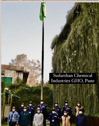
Sudarshan Chemical Industries GHO, Pune

We can proudly say that our booth was very busy in Cosmet'Agora January 2022 show. Thanks for visiting!