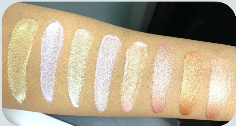
SU-SSC-01, SU-SSC-02, SU-SSC-03, SU-SSC-04, SU-SSC-05, SU-SSC-06, SU-SSC-07, SU-SSC-08

Wellness-focused innovation may be mainstream in facial skincare, but brands continue to try to be more disruptive in this space to stand out and help reduce consumer's stress levels or improve consumer's quality of sleep. Sudarshan's Haut Sculpt skin sculpting cream presents range of colors that makes your skin & body care formulations exceptional.