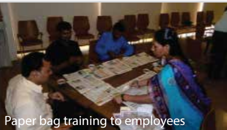
Paper bag training to employees