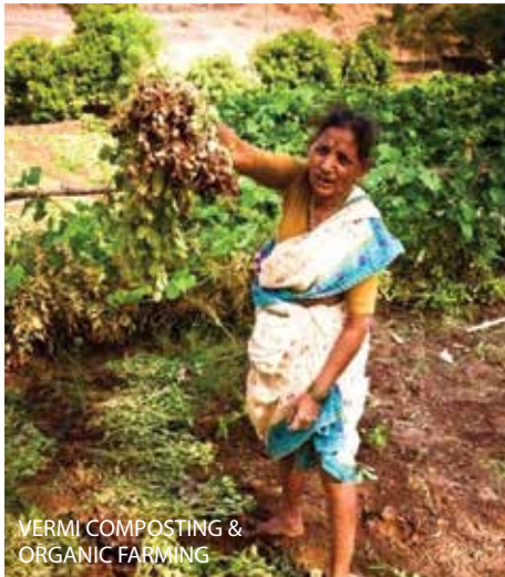
VERMI COMPOSTING & ORGANIC FARMING