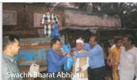
Swachh Bharat Abhiyan