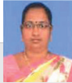
Vaishnavi Bhame Ambedwet

Mrs. Swapnali Nagare from Kalamshet. She successfully completed a course in cleaning product making. She has now started supplying toilet cleaning and phenyl to various hotels and is earning Rs.1500 to Rs. 2000 per month. Women who have successfully completed the course are making the products for their daily use at home and thus saving the expenses of Rs. 300 to 500 per month.