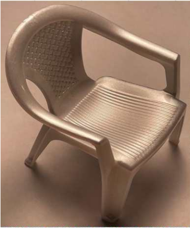
Silver Glam 35391 20-150 µm