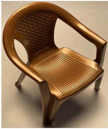
Walnut 43839 10-60 µm