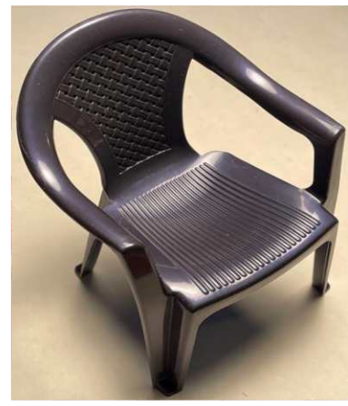
Regal Blue 41431 10-40 µm

To request samples, receive more information or set up a virtual presentation, please contact your local Sudarshan Representative today or email usa@sudarshan.com .