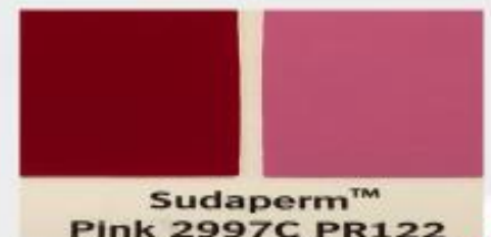
Sudaperm™ Pink 2997C PR122