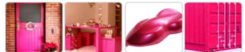
Sudapem™ Pink 2997C (PR122)