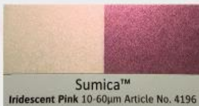
Sumica™ Iridescent Pink 10-60µm Article No. 4196