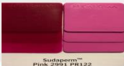
Sudaperm™ Pink 2991 PR122

2997C Sudaperm Pink – 26.4% 4196 Iridescent Pink – 23.3% 4970 Sumica Red – 46.7% 2985 Sudaperm Red – 1.7% 2996 Sudaperm Red Violet – 1.1%