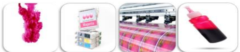
Sudejet™ Pink 5306D PR122