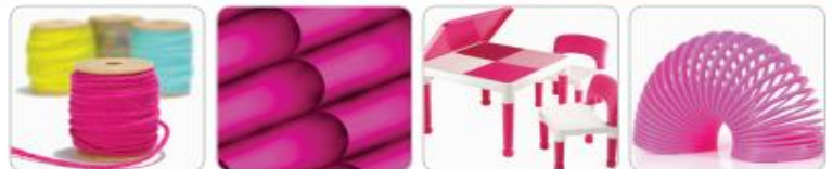
Sudapem™ Pink 2991 PR122