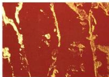
Base Coat: Red Decorative Top Coat: Sparkle Gold 4144 (10-100 µm)