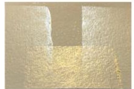
Base Coat: White Decorative Top Coat: Iridescent Gold 4195 & Blue 4197 (10-60 µm)