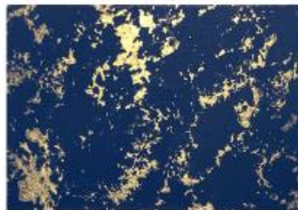
Base Coat: Blue Decorative Top Coat: Iridescent Gold 4195 (10-60 µm)