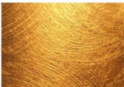
Base Coat: Yellow Decorative Top Coat: Medallion Gold PI235 (10-60 µm)