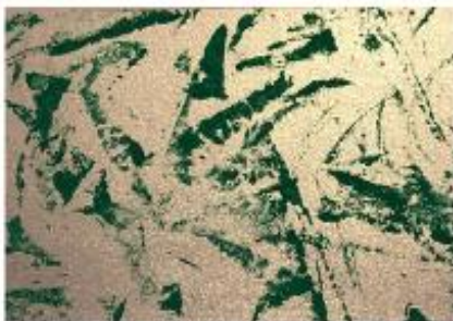
Base Coat: Silver Sparkle 4194 (10-100 µm) Top Coat: Green Decorative

Add luster and enhance the color of your walls with Sumica™ effect pigments.