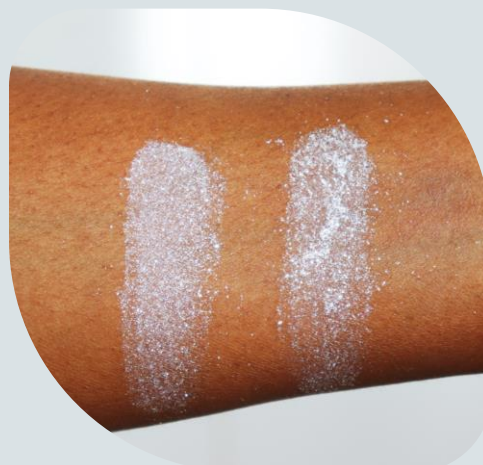
Sumicos Eco Glitter Silver 43187 (50-700µm)