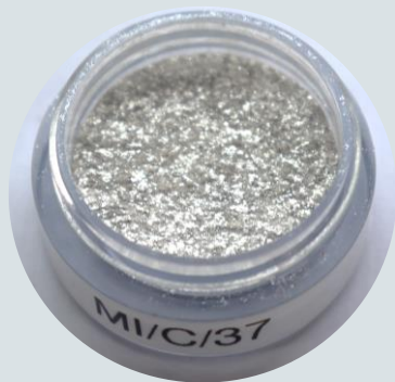
Sumicos Eco Mega Silver 43177 (40-450µm)

Sudarshan is excited to launch Sumicos Eco Mega Silver 43177 (40-450µm) and Sumicos Eco Glitter Silver 43187 (50-700µm). These large particle size silver pearls are based on natural mica to generate glittering effect in cosmetic formulations, while delivering a 100% biodegradable glitter-effect pigment!