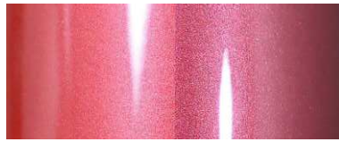
Sumica™ Red 4970 (10-60µm)