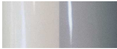
Sumica™ Silver Silky Fine 41124 (1-25µm)