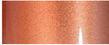
Sumica™ Copper 4967 (10-60µm)