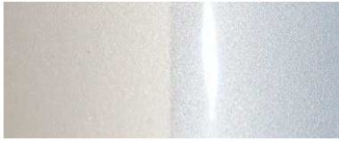
Sumica™ Silver Super Fine 4101 (1-15µm)

Natural mica platelets coated with Titanium Dioxide offers lustrous smooth satin silver to sparkling effect finishes. Available in a variety of particle size distributions.