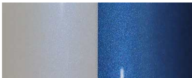
Sumica™ Iridescent Blue 4197 (10-60μm)