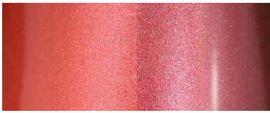
Sumica™ Maroon 4969 (10-60µm)