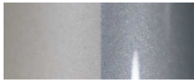
Sumica™ Silver 4179 (10-60µm)