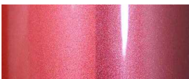
Sumica™ Maroon 41937 NXR (10-40µm)

Sumica Maroon 41937NXR offers smooth maroon effect. It is iron oxide coated mica pigment processed with chrome-free treatment having excellent weather resistance. Mainly recommended for automotive paints.