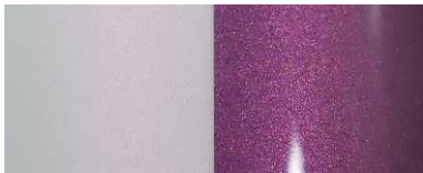
Sumica™ Iridescent Pink 4196 (10-60μm)