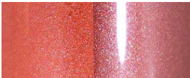
Sumica™ Super Maroon 4979 (20-200µm)