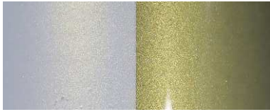
Sumica™ Iridescent Gold 4195 (10-60μm)

Natural mica platelets coated with Titanium Dioxide offering smooth, lustrous, two tone effect finishes. Available in standard particle size distributions.