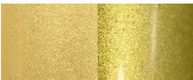
Sumica™ Sparkle Gold 4144 (10-100 \mu m)