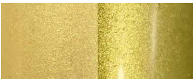
Sumica™ Super Flash Gold 41665 (15-150 \mu m)