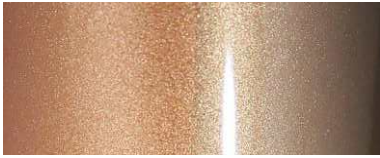
Sumica™ Bronze 4964 (10-60µm)

Natural mica platelets coated with Iron Oxide offering lustrous bronze, copper & maroon effect finishes. Available in standard & sparkle particle size distributions.