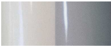
Sumica™ Bright Fine Silver 41126 (5-25µm)