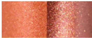
Sumica™ Super Copper 4977 (20-200µm)