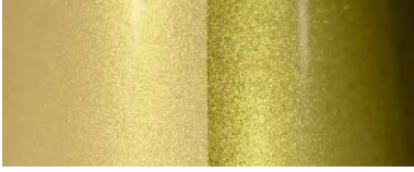
Sumica™ Bright Gold 4199 (10-60 \mu m)

Natural mica platelets coated with Titanium Dioxide & Iron Oxide offering lustrous gold effect finishes. Available in a variety of particle size distributions.