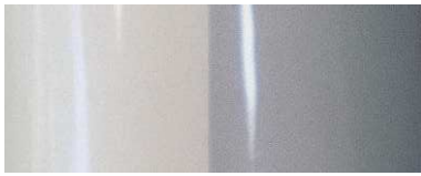
Sumica™ Silver Fine 4191 (1-25µm)