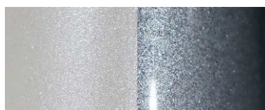
Sumica™ Silver Super Flash 4153 (20-200µm)