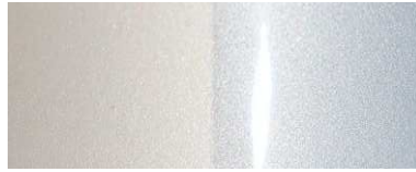
Sumica™ Super Fine Silver 41111 (1-15µm)