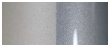
Sumica™ Silver 41134 (10-60µm)