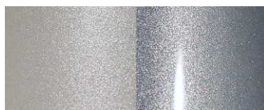
Sumica™ Silver Sparkle 4194 (10-100µm)