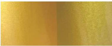
Sumica™ Luminous Gold 41634 (10-60 \mu m)