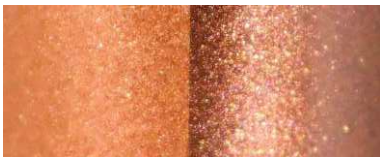
Sumica™ Super Bronze 4974 (20-200µm)