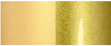
Sumica™ Medallion Gold PI235 (10-60 \mu m)