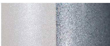
Sumica™ Silver Flash 4152 (15-150µm)